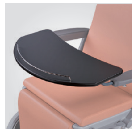
Table with safety barrier