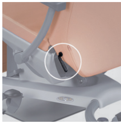
Independent adjustment of backrest