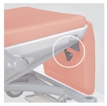
Independent adjustment of legrest