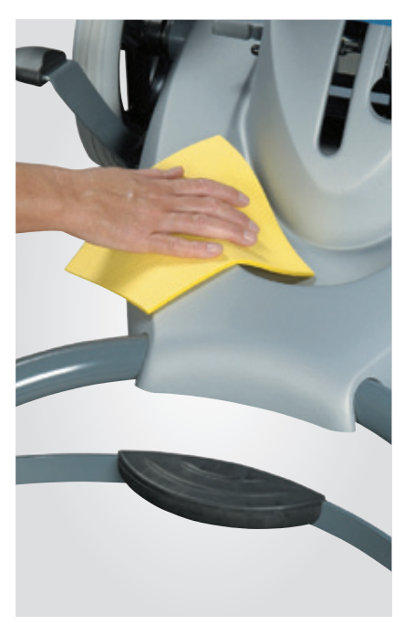
Easy and quick cleaning with common cleaning and desinfecting agents.