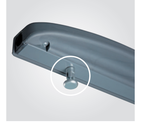
Table safety lock