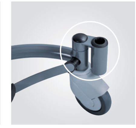
Holder for infusion stand