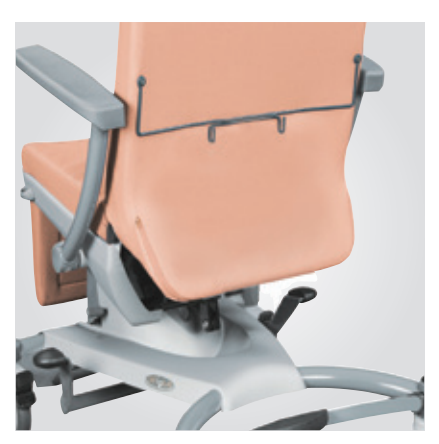
Urine bag holder