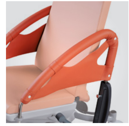
Side support (pair)